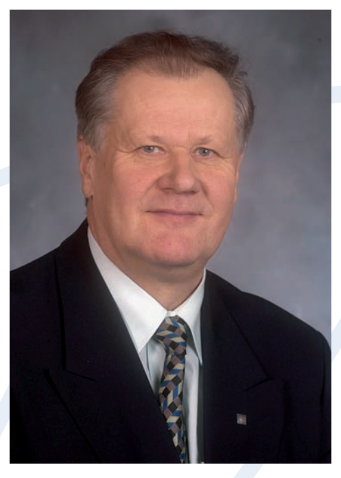
European Security and Defence Policy - the Finnish Focus

Finland has been an active contributor to the development of European Security and Defence Policy since the very beginning. In our view, it is essential to continue developing the Common Foreign and Security Policy (CFSP) and the European Security and Defence Policy (ESDP) in order to meet the security needs and requirements of today and tomorrow. It goes without saying that the Union's external activities are also carried out in numerous other areas, such as development policy and trade. The Union has a wide range of instruments available and this makes it a unique player among various international actors. At the same time, coordinating these activities remains one of its biggest challenges.